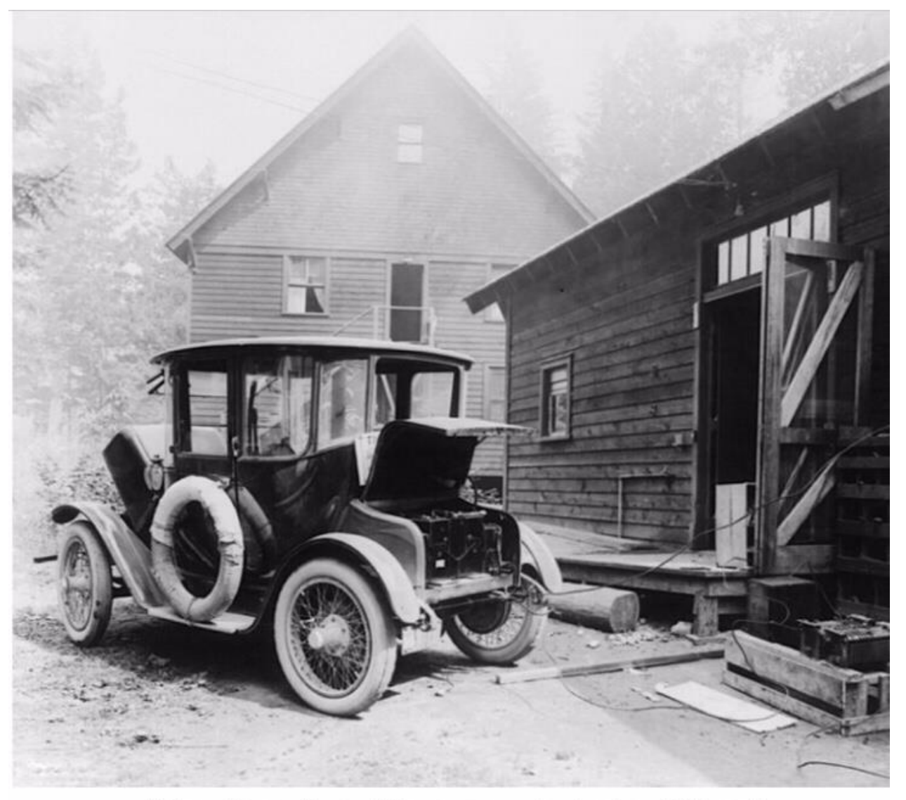
When the automobile economy looked so different Charging an electric car in 1905